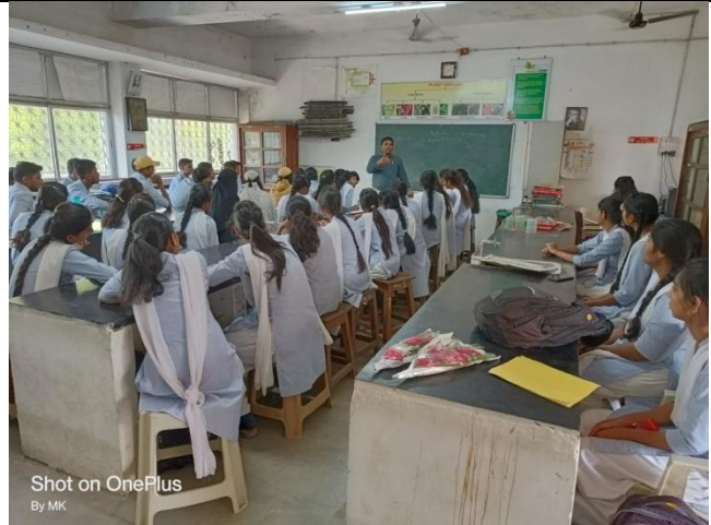
Earth Day Celebration ( Cycas Plantation )

Chikhli, Maharashtra, India 9727+7V7, MH SH 176, Gandhi Nagar, Chikhli, Maharashtra 443201, India Lat: 20.360414° Long: 76.264651° 22/04/22 05:11 PM