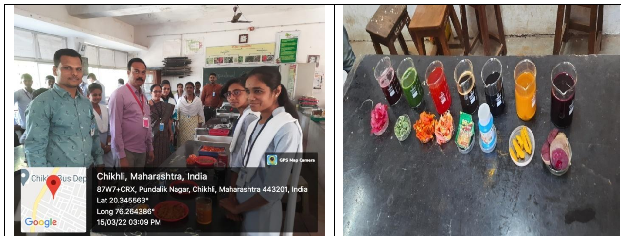
Eco Friendly Color Preparation Workshop