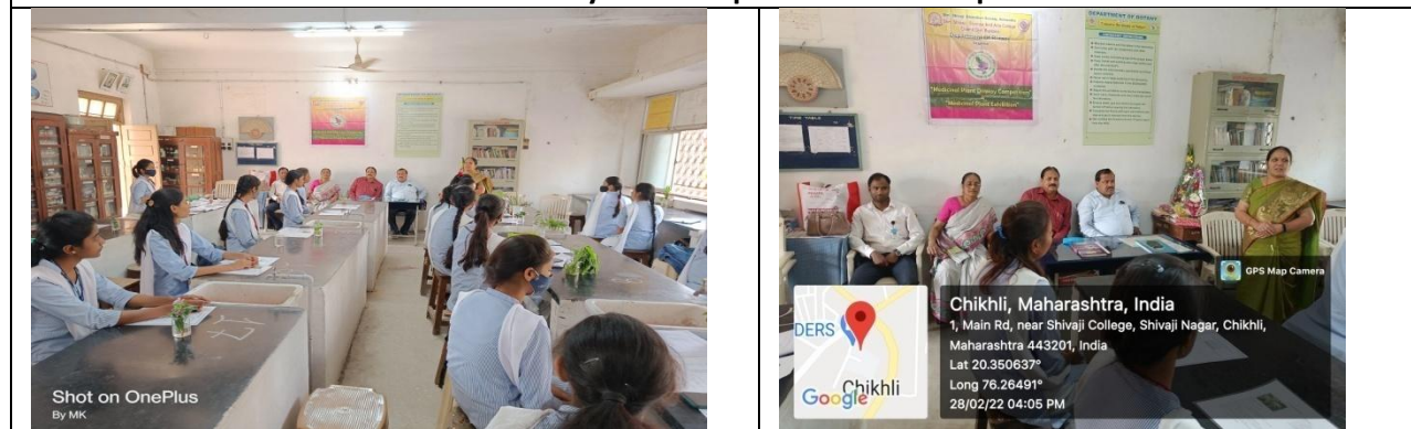
Medicinal Plant Exhibition