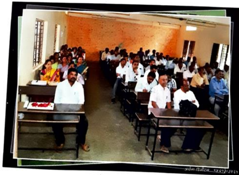
Participants in National Level workshop on “E-Governance” Held on 21 st February 2018