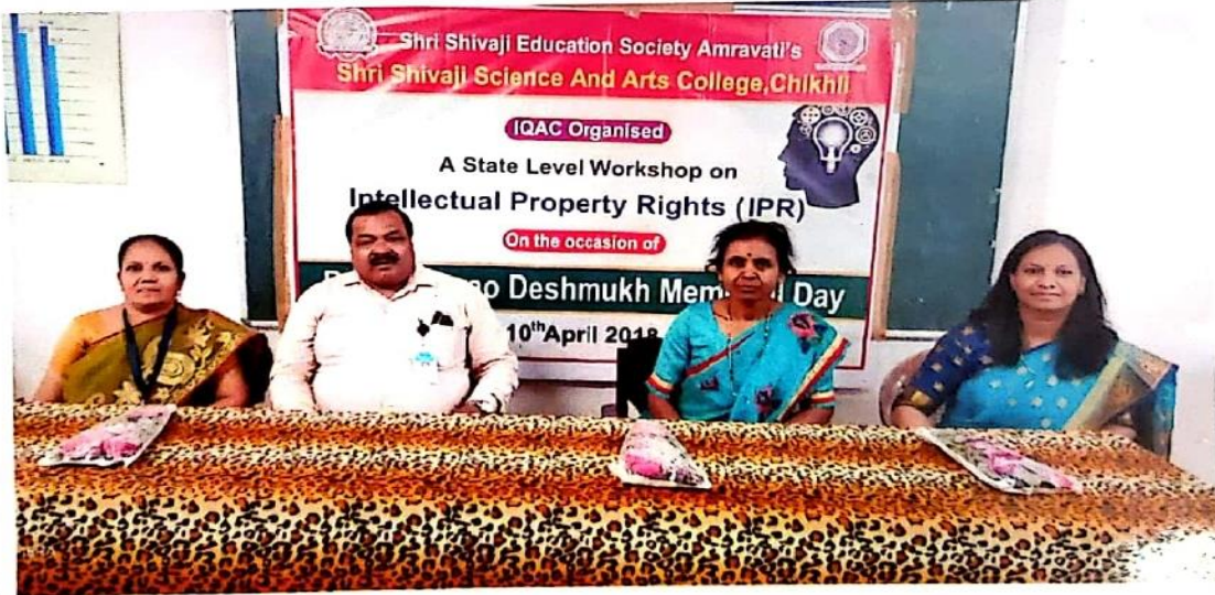
State Level Workshop on IPR