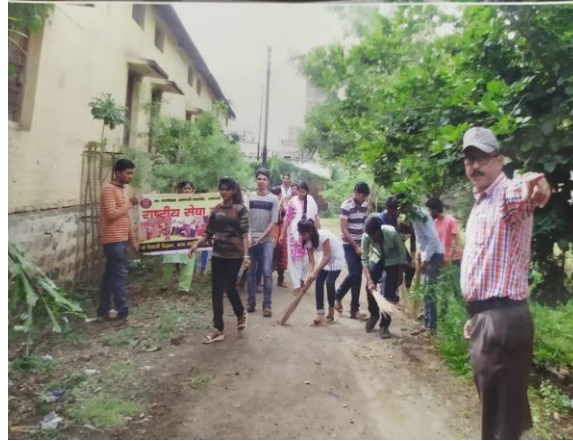
NSS volunteers participated in cleanliness drive on dated 27/02/2021

Department of National Service Scheme, Shri Shivaji Science and Arts College, Chikhli on the occasion of Birth Anniversary of deity of NSS Late Sant Gadge Baba has run cleanliness campaign in college campus. On February 27 th , Birth Anniversary of deity of NSS Late Sant Gadge Baba was celebrated through cleanliness drive in college campus. NSS volunteers actively cleaned up the whole college campus from main gate to Ganpati Mandir parisar of the college.