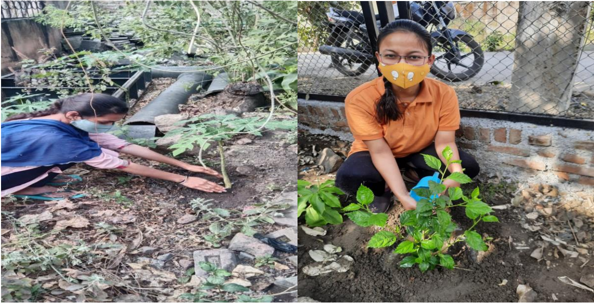
NSS volunteers planting tree under tree plantation programme on dated 15/07/2020