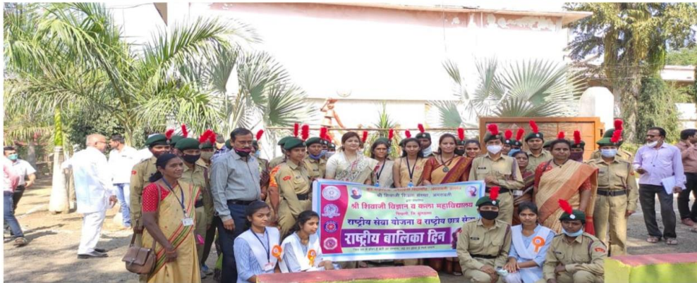
National Girl Child Day 24/1/2021