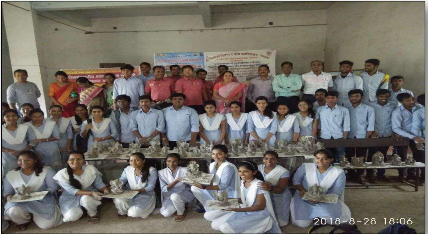
Eco-friendly Ganesh Idol Making Workshop