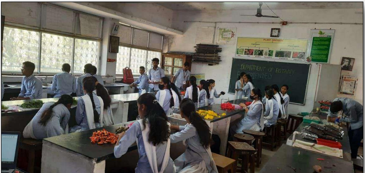
Eco-friendly Colour Preparation for Holi