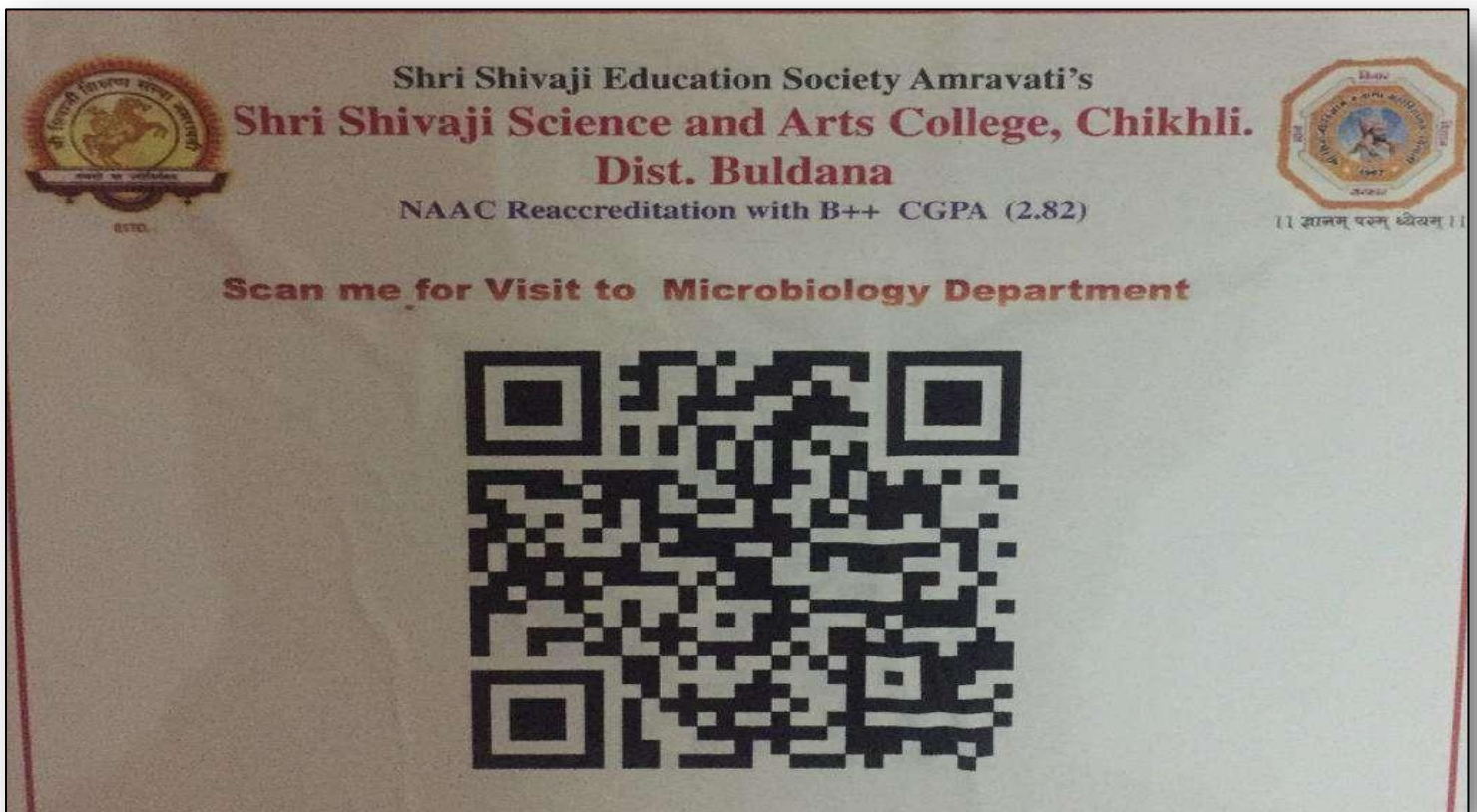
QR Code Department of Microbiology