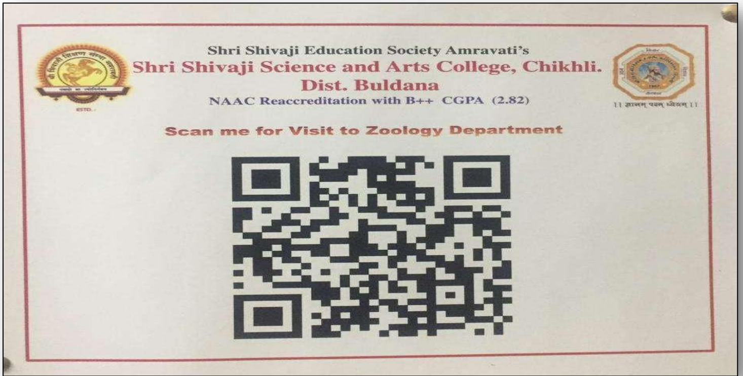
QR Code Department of Zoology