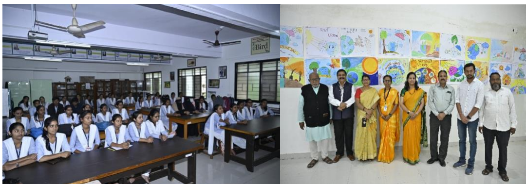
Students and Guests in Celebration of World Ozone Day

3) Title: In-house workshop of Virtual Lab on Handling of Light Microscope