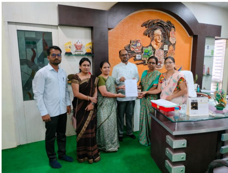
Release of the Handbooks