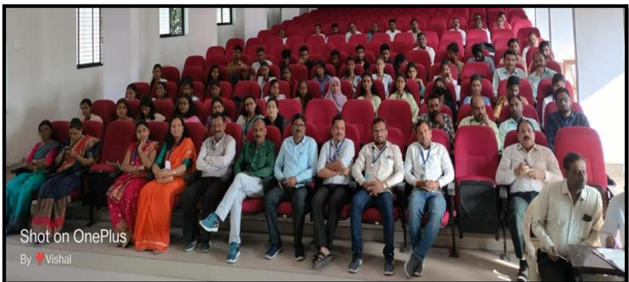
Students and Staff listening to the speakers of the Elocution Competition