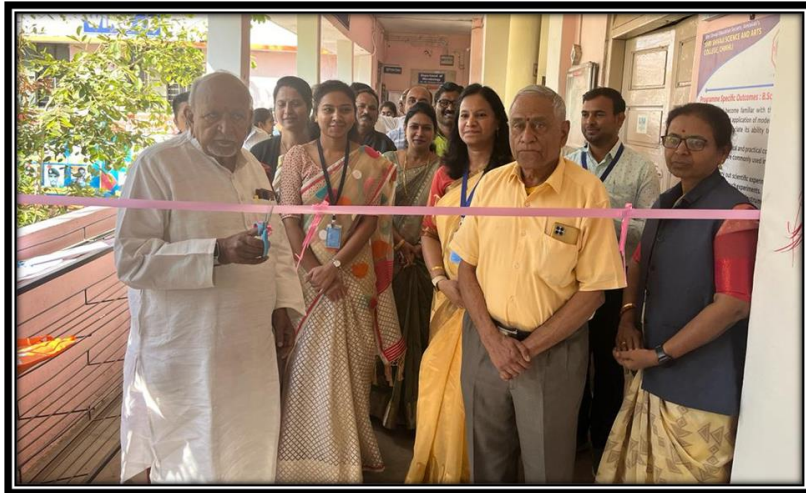
Inauguration of the Rangoli Competition by Shri Madhukaroao Patil