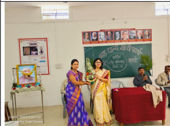
2023.12.24 11:31 Powered by Triple Camera