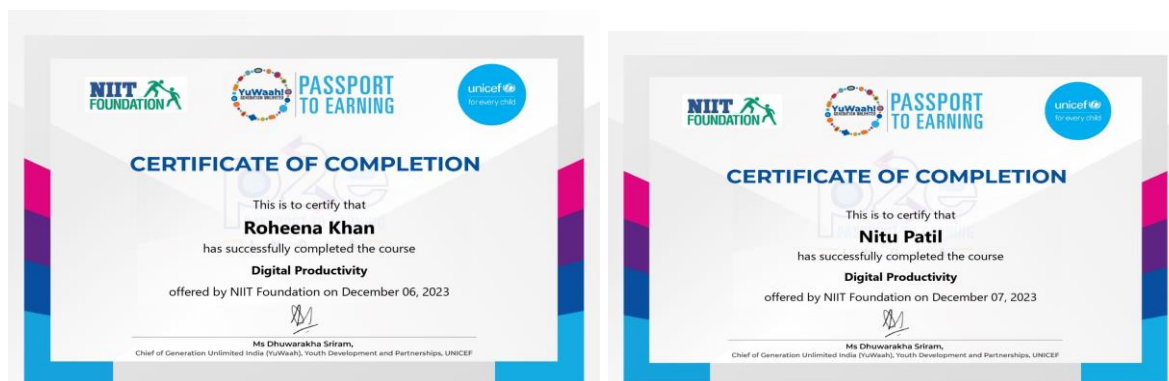
Certificates given to students after the completion of the Training