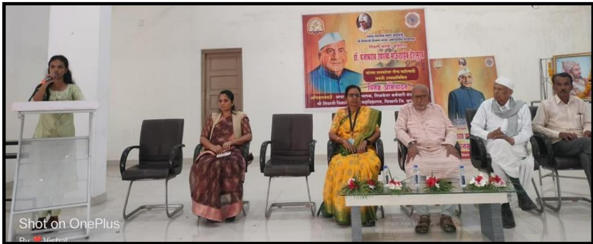
Student presenting her views