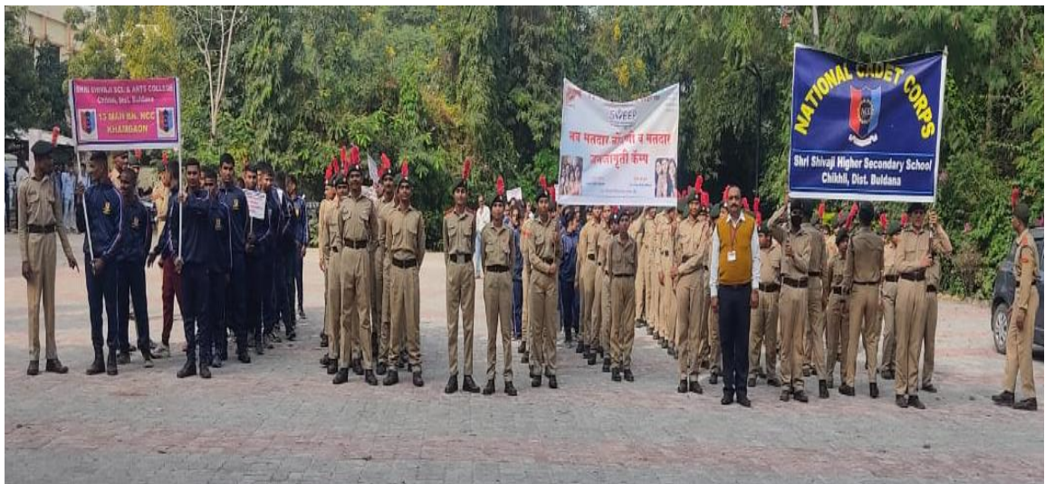
Participant students NCC Cadets and NSS volunteers in Voter Awareness Rally