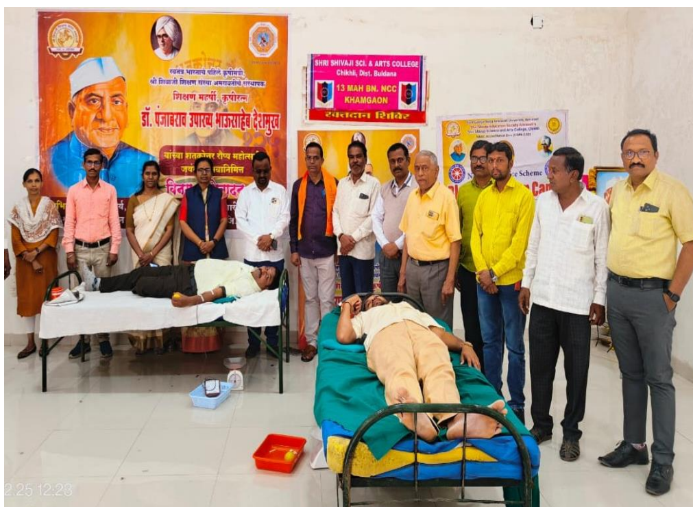
Students donating blood