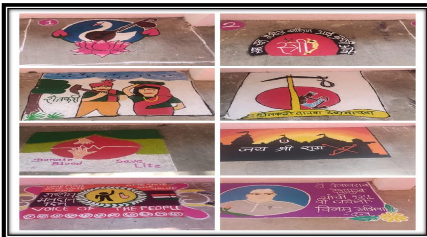
Rangoli Drawings by Students