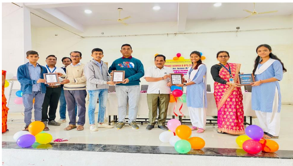
The Participant students in the Competitions were given Prizes