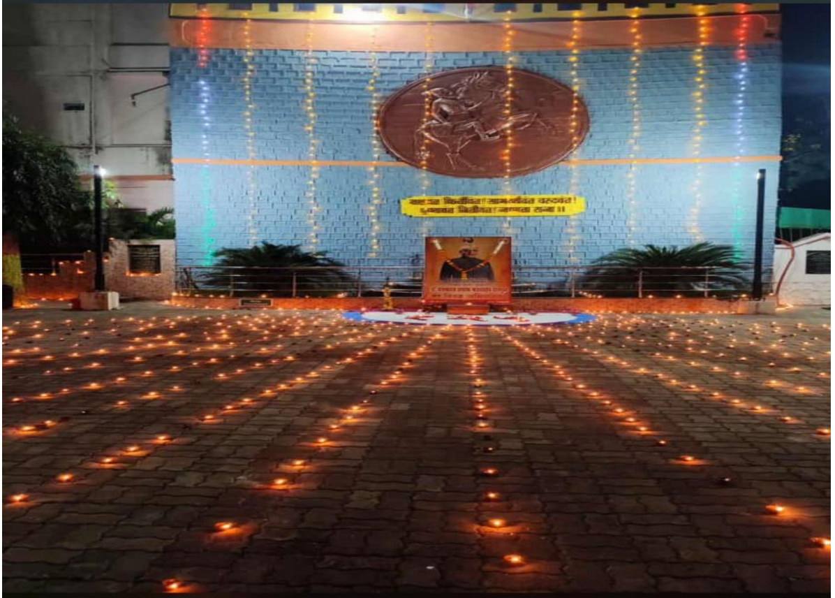
Homage is paid to Dr. Panjabrao alias Bhausaheb Deshmukh by enlightening lamps (Panti)