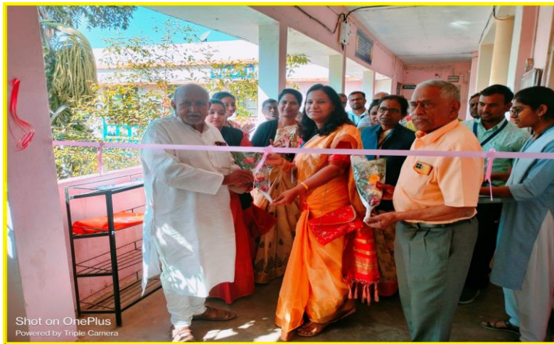
Inauguration of the Poster Competition by Shri Madhukaroao Patil