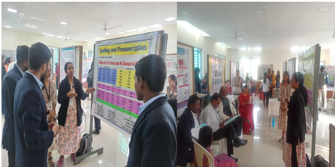
Demonstration of the Project to the Panel of Jury at SGB Amravati University

Outcome: The participant students were introduced to the research area of English Language. Students came to know the method and procedure to carry out research.