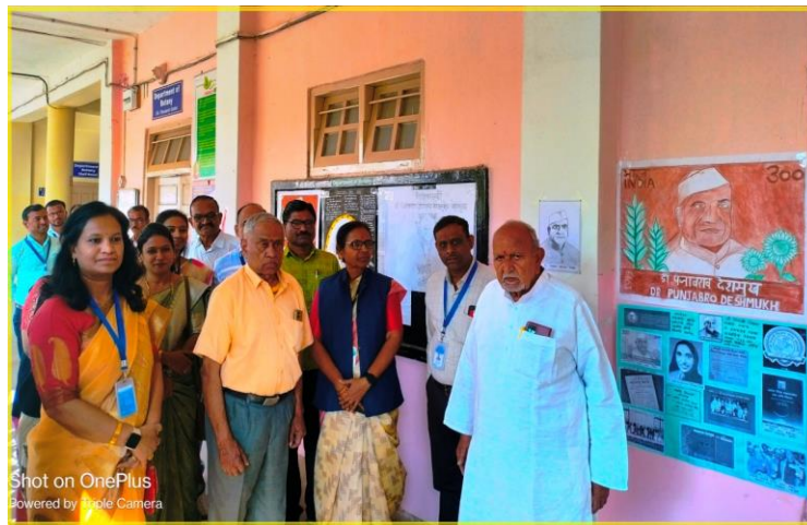
Posters were displayed on wall