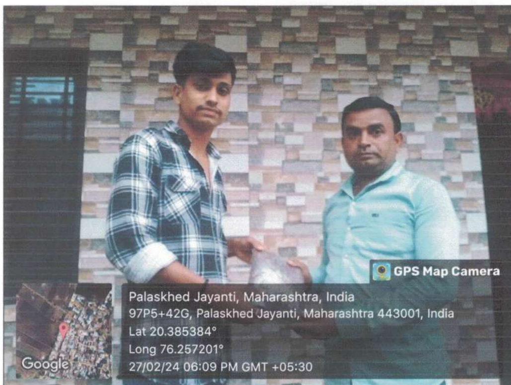
Distribution of bio-compost fertilizer to farmers by NSS volunteers during NSS special camp 2023-24 at Valati.