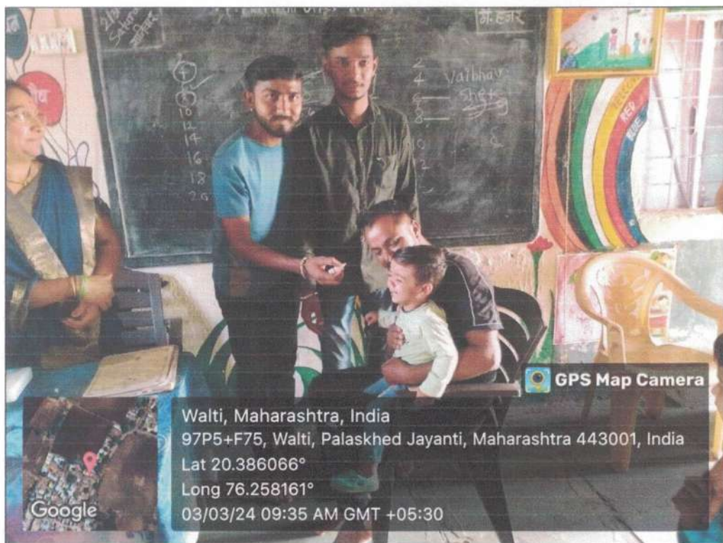
NSS volunteers collecting and carrying large stone in order to construct water harvesting dam during NSS special camp 2023-24 at Valati.