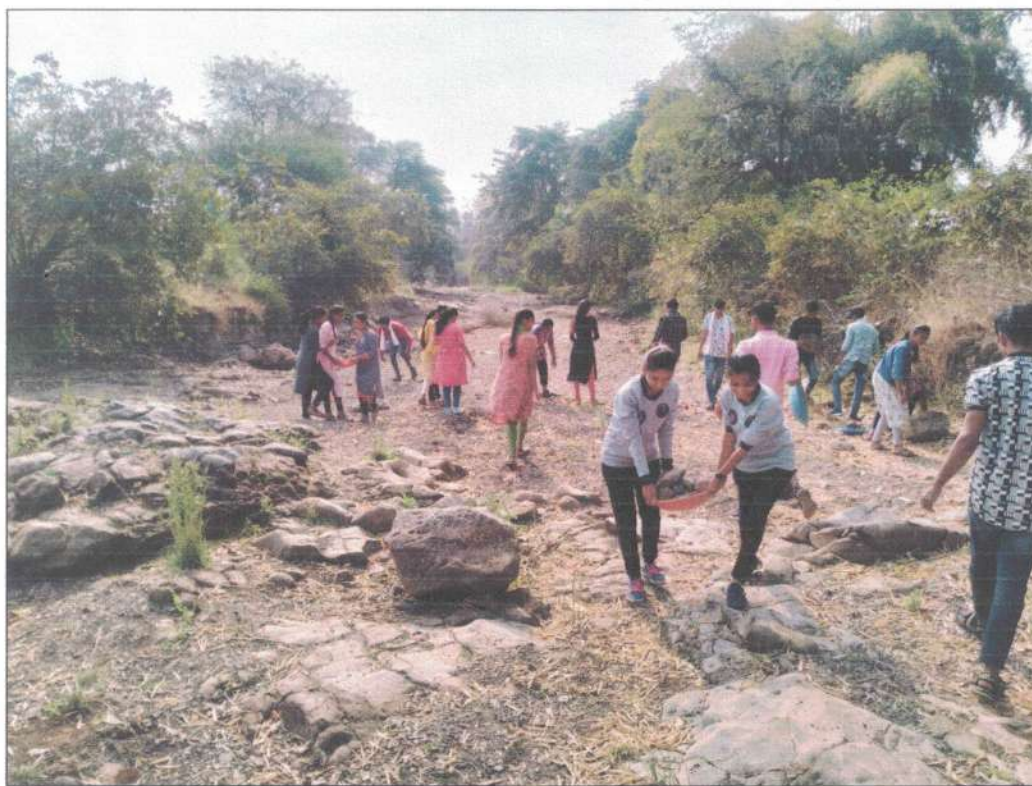
NSS volunteers collecting and carrying large stone in order to construct water harvesting dam during NSS special camp 2023-24 at Valati.