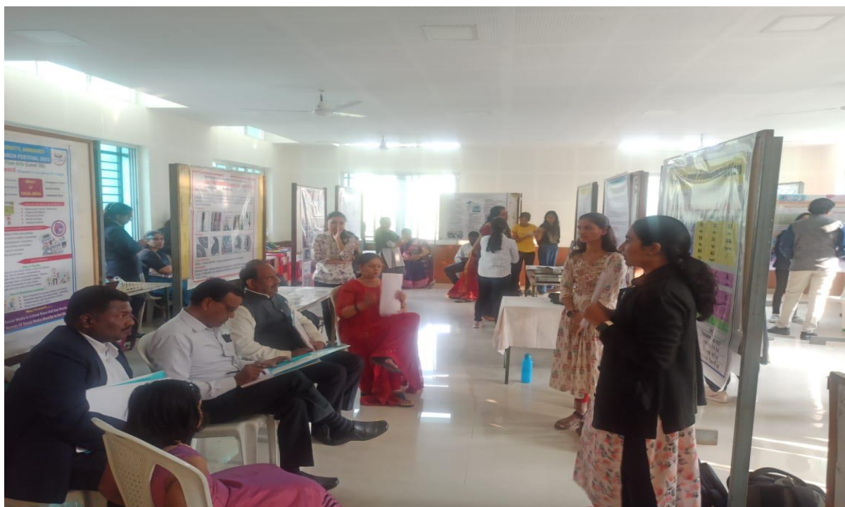
Students giving presentation in presence of Panel of Jury