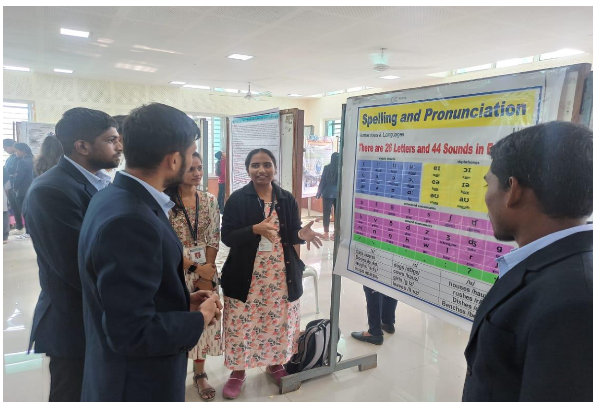
Students giving presentation in presence of Panel of Jury