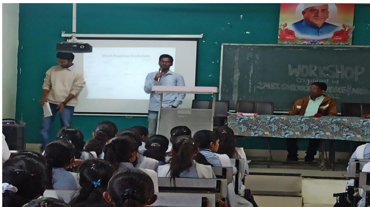
Presentation of the Project by Research Students