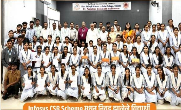
Infosys CSR Scheme मधुन निवड झालेले विद्यार्थी