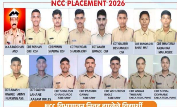
NCC विभागातून निवड झालेले विद्यार्थी