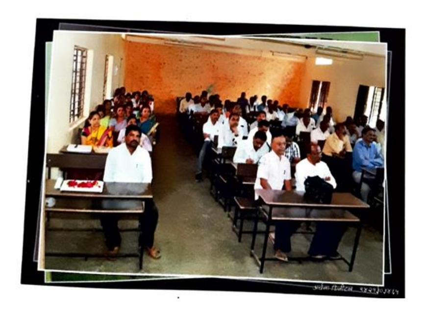
Participants in National Level workshop on "E-Governance" Held on 21st February 2018