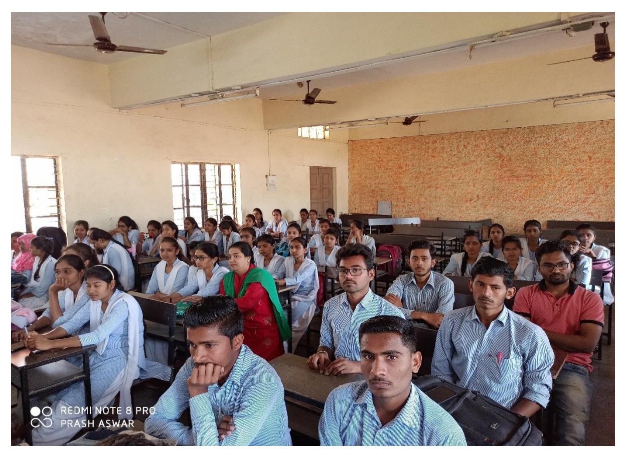
Participants, in the State level Workshop on Ethical Hacking held on 25 February 2020