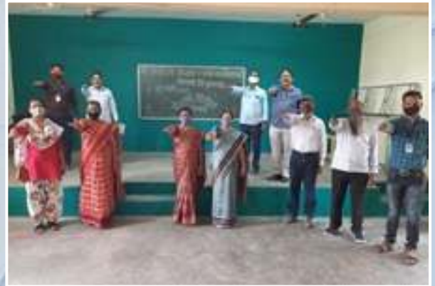
Oath for water conservation on world water day by faculties of college