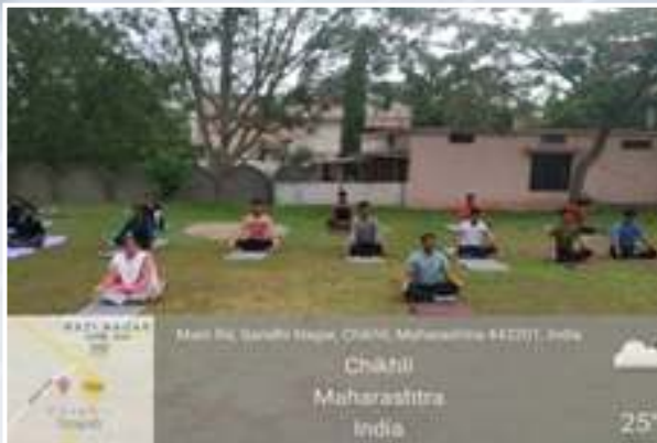
Teachers and Students performing yoga on World Yoga Day