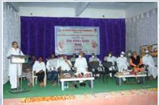
Address by Hon'ble President Shri Shivaji Education Society, Amravati on the occasion of foundation laying and felicitation of retired employee ceremony.