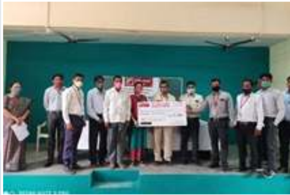
Financial help from IDFC Bank to female students