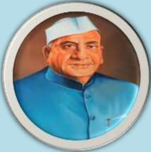
Shikshan Maharshi, Krishiratna Late Dr. Panjabrao alias Bhausaheb Deshmukh Ex. Union Agri. Minister Life Sketch Birth: 27 Dec. 1898 (Gita Jayanti) Death: 10 April 1965 (Ram Navami)

1931-1932: Foundation of Shri Shivaji Education Society (Founder President)