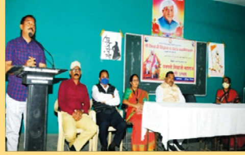
छत्रपती शिवाजी महाराज जयंती