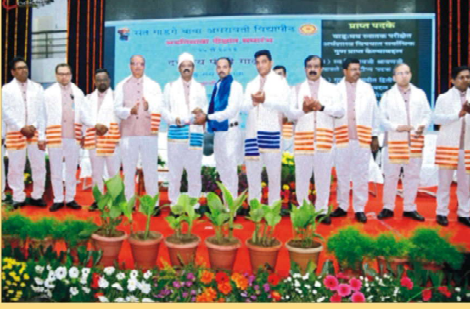
दत्तात्रय गाडगे विद्यापीठ सुवर्ण पदक वितरण समारंभ