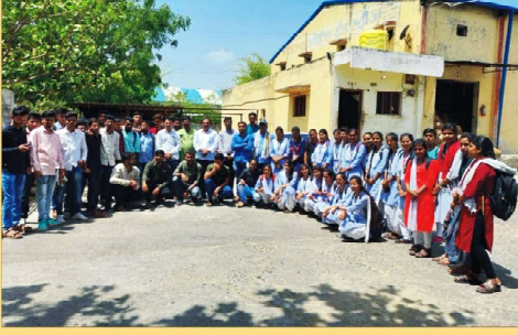
वाणिज्य व व्यवस्थापन विद्यार्थ्यांची चिखली एम.आय.डी.सी. ला भेट