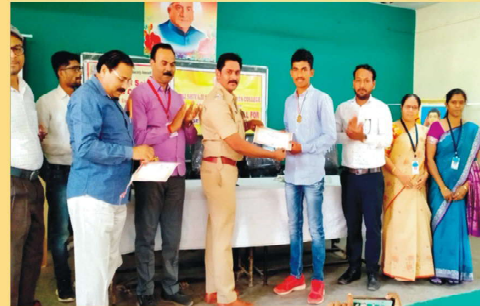
महिला सबलीकरण कार्यशाळा