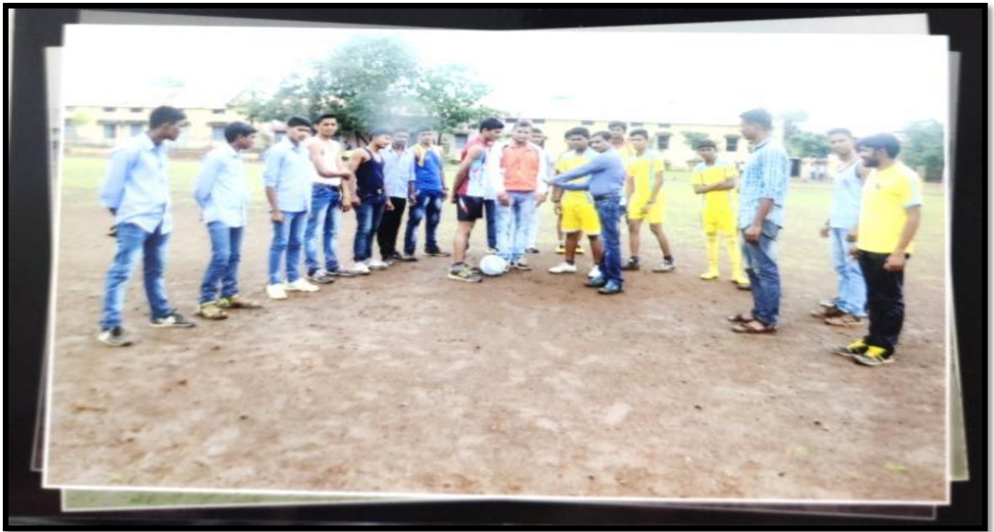
Football boys' team